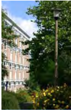
Halls of Residence