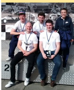
Docendo Racing Team “Greenpower 24+”