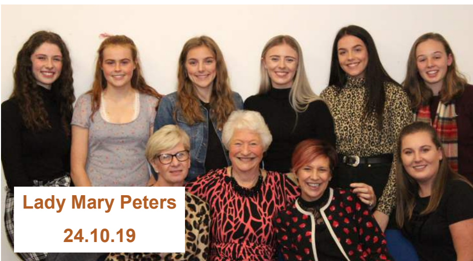
Lady Mary Peters